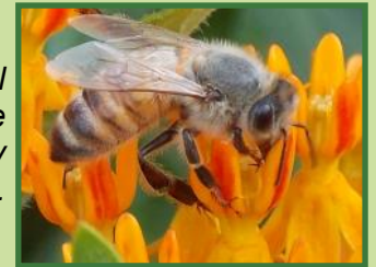
Local Honeybee on a butterfly plant.